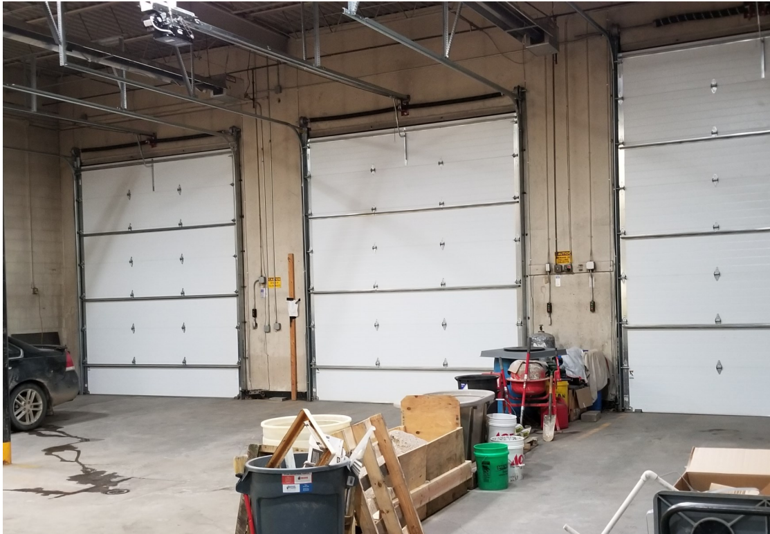
Warehouse Overhead doors Warehouse bay has Radiant heat